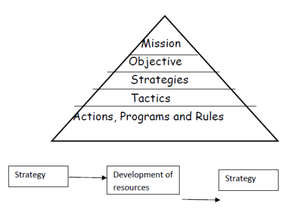
Figure 1. Stages of decision making processes.

Strategic Management is the organized development of the functional areas; financial, manufacturing, marketing, technological, manpower etc in the pursuit of its objectives. It is the use of all the entity's resources available. The complex nature of many large organizations has led to the splitting of strategies into inter-related levels comprising the hierarchy of process in the figure 1 below.